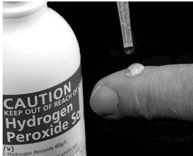
Photo 1: Hydrogen peroxide is rapidly broken down (to oxygen and water) when it is exposed to the activity of the enzyme catalase present in a small drop of blood on a pricked finger.

The enzyme that produces hydrogen peroxide in honey becomes active only when honey is diluted. But the non-peroxide antibacterial activity is at full strength in undiluted manuka honey, which will provide a more potent antibacterial action diffusing into the depth of infected tissues. (See Photo 2 below.)